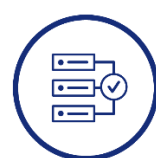
DATA, DEFINITIONS & STANDARDS