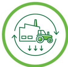
A NET ZERO FOOD SYSTEM