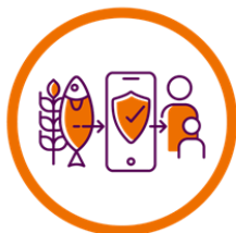
REDUCING RISK FOR A FAIR & RESILIENT FOOD SYSTEM

Grow the circular food economy through packaging & labelling