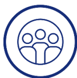
COMMUNITY & COALITIONS