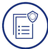
POLICY AND REGULATION