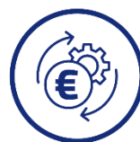
FINANCING FOR CHANGE