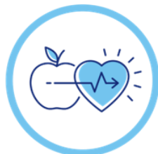
HEALTHIER LIVES THROUGH FOOD